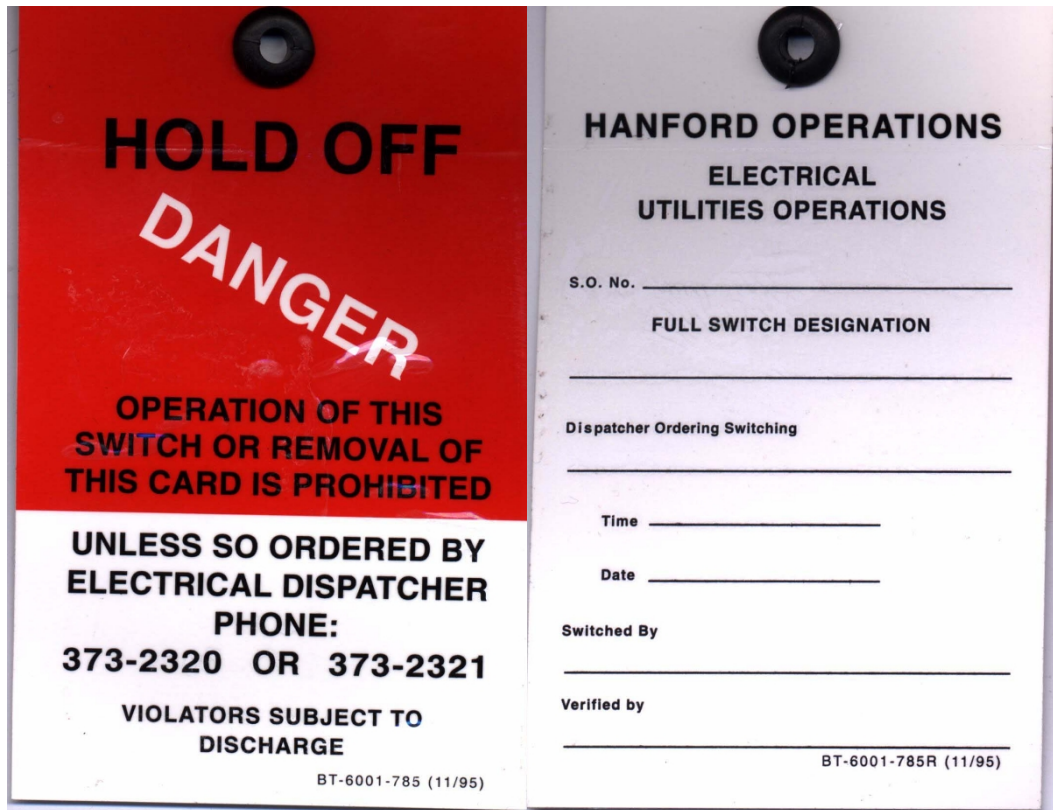
Figure 2. Example Hold Off Tag